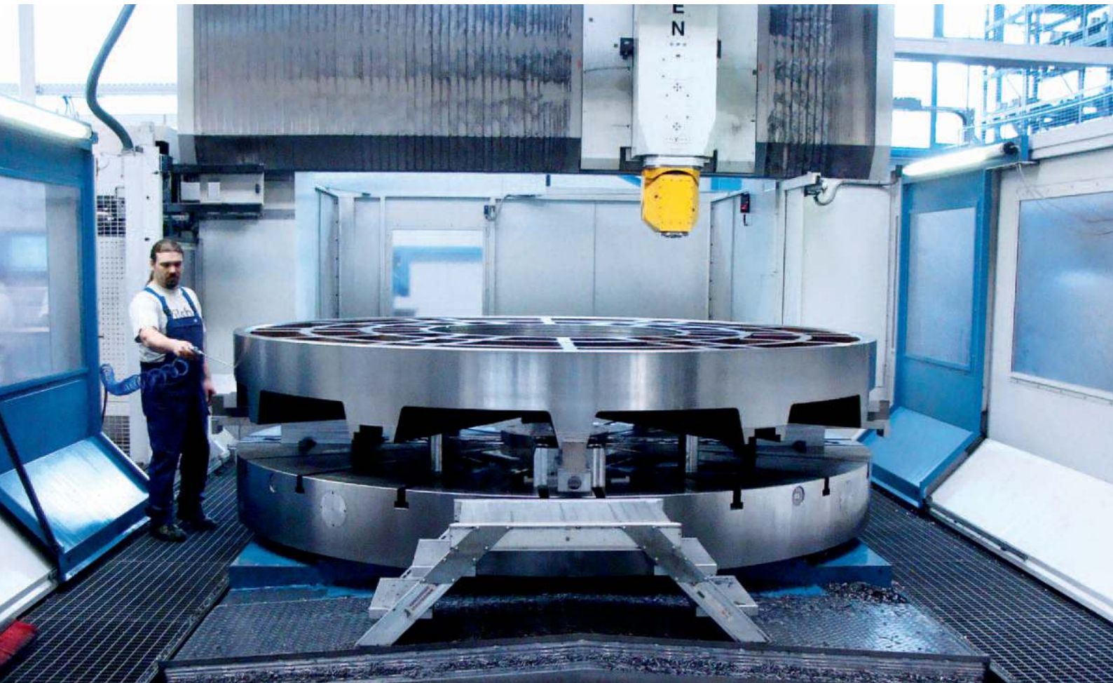
Special portal lath and milling machine