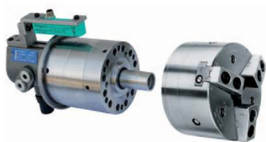
Power clamping technology

Now designers can work more efficiently which ultimately results in saving costs. In the eight years we have been using the parts management system, our product range has considerably increased. Needless to say this resulted in an increase of required parts as well. However, we are expecting that the new creation of parts increased only slightly compared to the diversity of parts used for our new developments. By using PARTSolutions unnecessary parts growth will be avoided.”